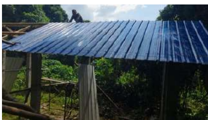
Construction of Village knowledge center in progress in Maingittim, South Garo Hills, Meghalaya