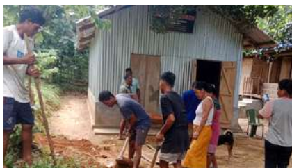
Rongrengpal Church of South Garo Hills getting ready for 3days leadership programme.