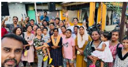
"Say No to Drugs" campaign in Siliguri, West Bengal