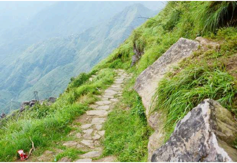
Laitlum canyon, East Khasi Hills District, Meghalaya, India.

Laitlum Canyons offers breathtaking panoramic views of the state of Meghalaya, making it an ideal destination for nature enthusiasts. The name "Laitlum Canyons" translates to "end of the world" or "end of hills," perfectly capturing the awe-inspiring beauty of this location. Situated approximately 45 km from the city of Shillong, Laitlum Canyons is a must-visit for anyone seeking a peaceful retreat amidst stunning natural landscapes.