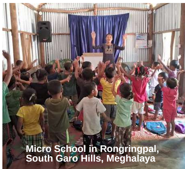
Micro School in Rongringpal, South Garo Hills, Meghalaya

In the remote villages of Garo Hills, Meghalaya, access to quality education remains a challenge due to difficult terrain, scattered populations, and limited infrastructure.